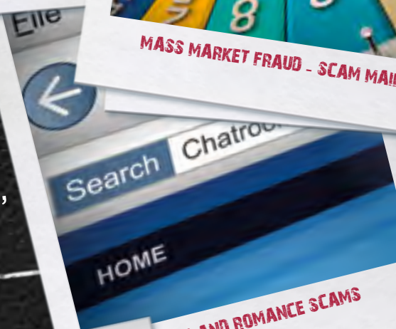
DATING AND ROMANCE SCAMS

JUST REMEMBER: IF IT SOUNDS TOO GOOD TO BE TRUE, IT PROBABLY IS.