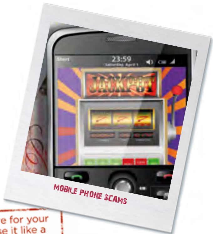
MOBILE PHONE SCAMS