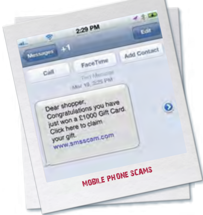
MOBILE PHONE SCAMS