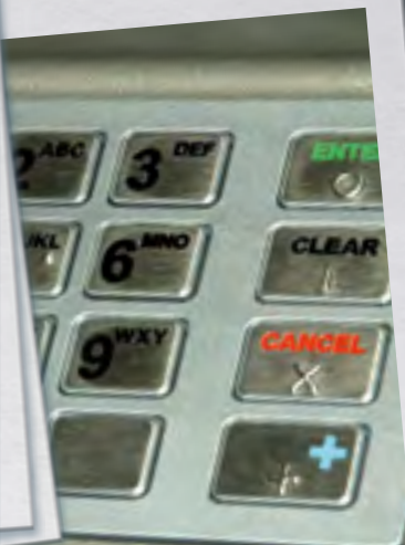
BANKING AND PAYMENT CARD SCAMS