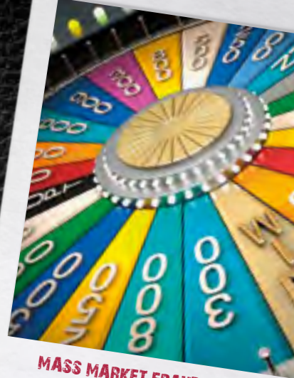
MASS MARKET FRAUD - SCAM MAIL